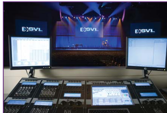
Heart Community Church renovated a declining mall in Rockford, Illinois into their house of worship. Jands' Vista lighting console controls their extensive lighting system, and SLS line arrays are utilized for front-of-house audio.

Rather than build on the church's existing 80-acre property, the land was sold and funds were used to purchase a declining 350,000 square-foot enclosed mall. In Decem-