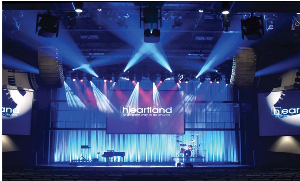
The church’s lighting system was designed with flexibility in mind to accommodate HCC’s ever-changing style of worship.

Installed in the amp room underneath the stage in the basement—now the technology floor—are 24 Lab.gruppen C68:4 and seven C28:4 amplifiers. Musicians onstage rely on a personal Aviom monitoring system. The majority of mics used in the main venue are the Shure Wireless U Series capable of being networked for computer monitoring. Guarino selected the Shure U Series based on dependability, customer support, and because “the Shure’s tonality maintains the character of the original wired version very well,” says Guarino.