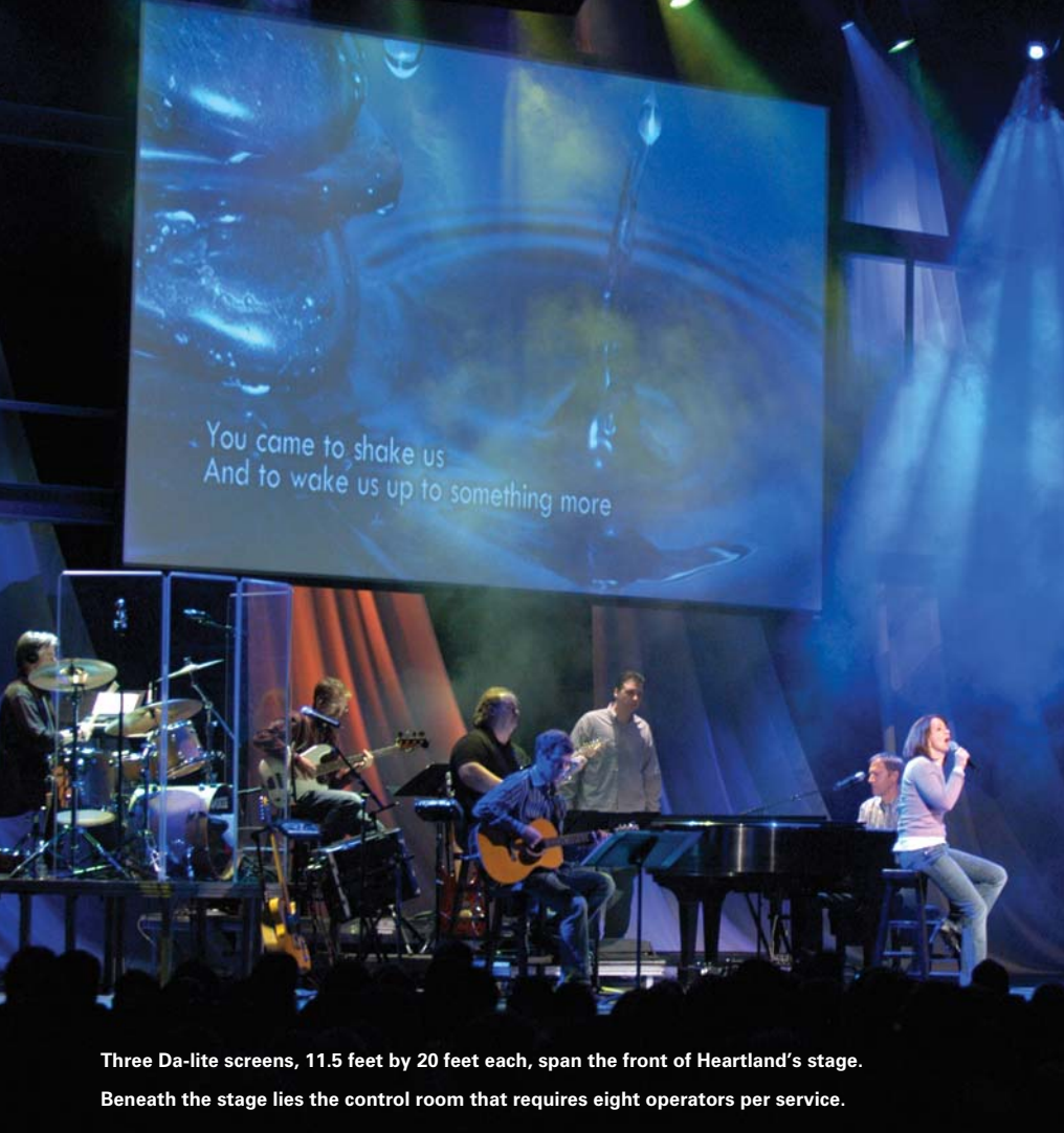
Three Da-lite screens, 11.5 feet by 20 feet each, span the front of Heartland's stage. Beneath the stage lies the control room that requires eight operators per service.